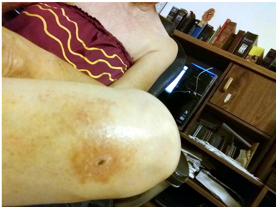
December 22, 2018