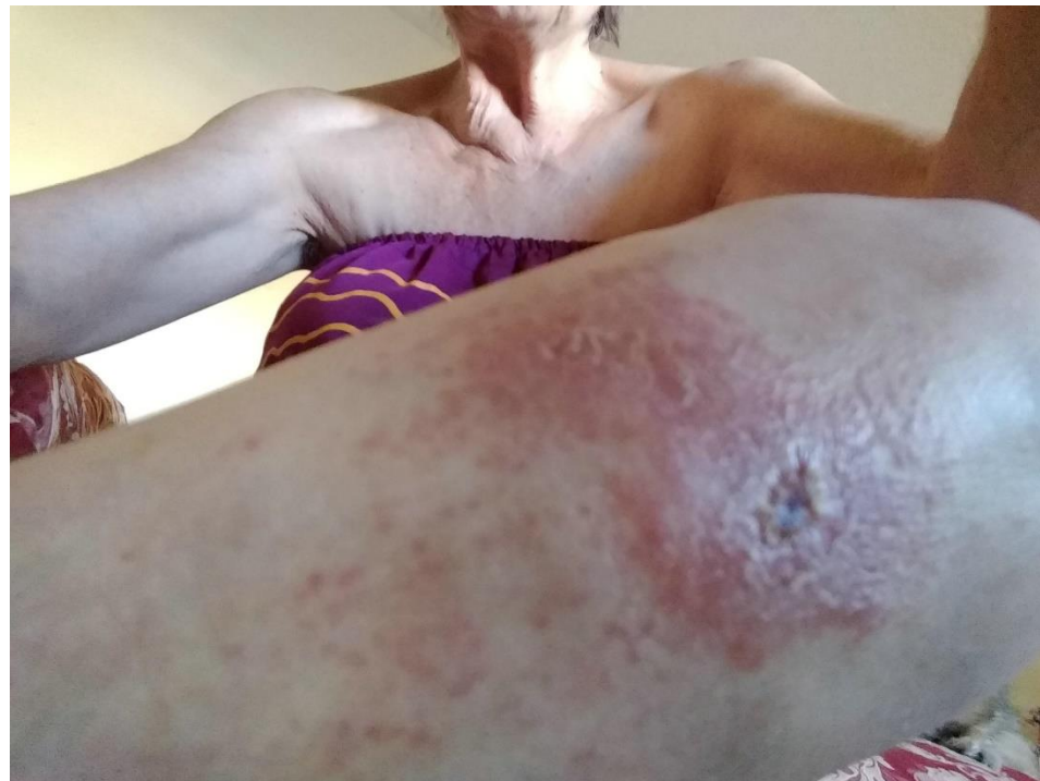
December 20, 2018